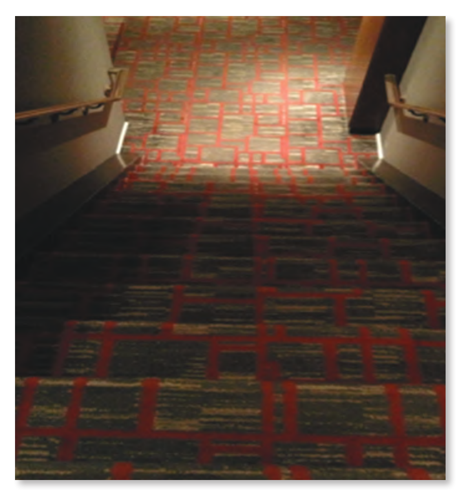
Figure: A typical carpet pattern on stairs that makes it difficult to see where one step ends and another begins. Stairs should be clearly demarcated with contrasting strips and well lit.